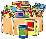
Feeding the Community